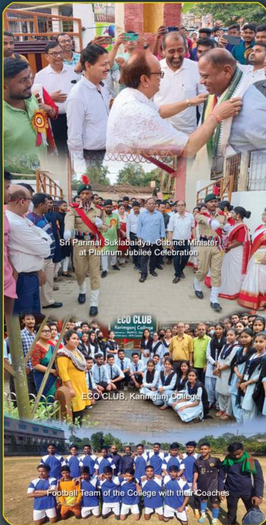
Sri Parimal Suklabaidya, Cabinet Minister at Platinum Jubilee Celebration