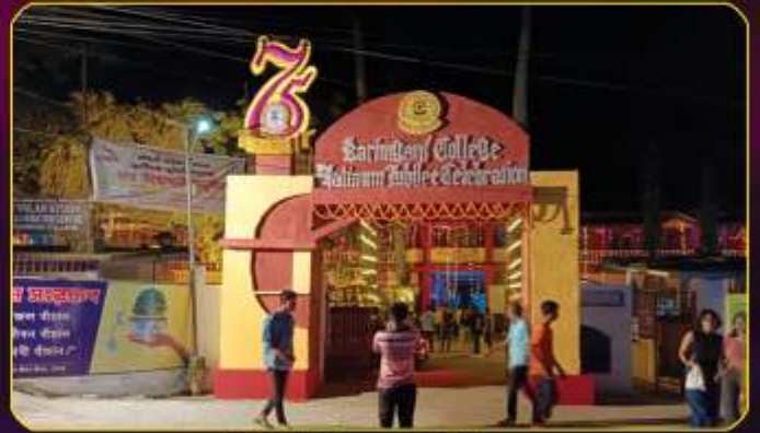
Night View of College in Connection with Platinum Jubilee Celebration