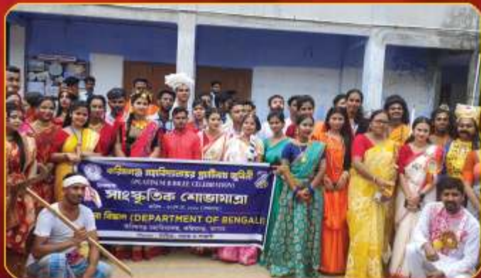
Group Picture by Department of Bengali in relation to Platinum Jubilee Celebration