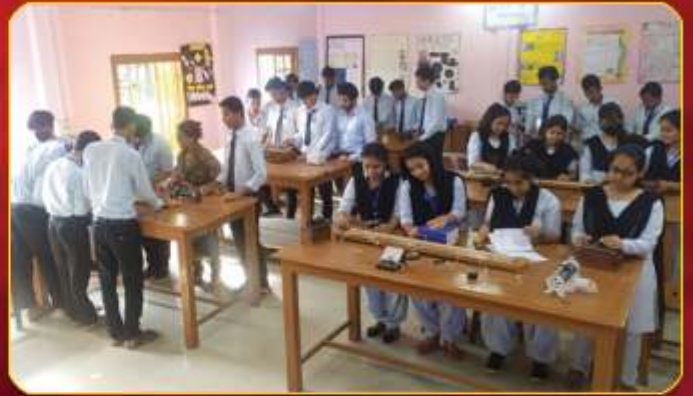
Laboratory Demonstration: Department of Physics