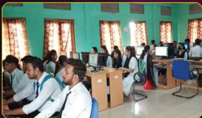
Computer Practical Class: Department of Commerce