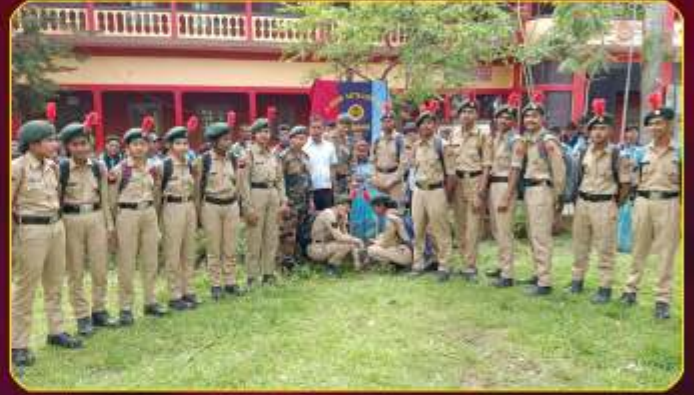
NCC Unit of Karimganj College