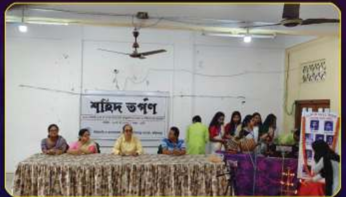
Observation of Bengali Language Martyrs Day