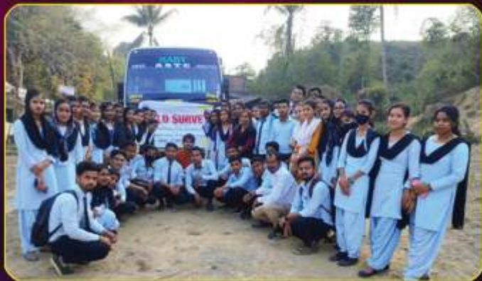
Field Survey at Barapunji Village of Karimganj Department of Economics