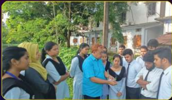
Field Demonstration: Department of Botany