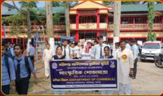
A Moment of Shovajatra by Dept. of Commerce in connection with Platinum Jubilee Celebration