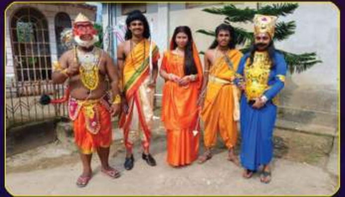
Students of Department of Bengali act as Hanuman, Ram, Sita, Laksman, Ravana in Shovajatra