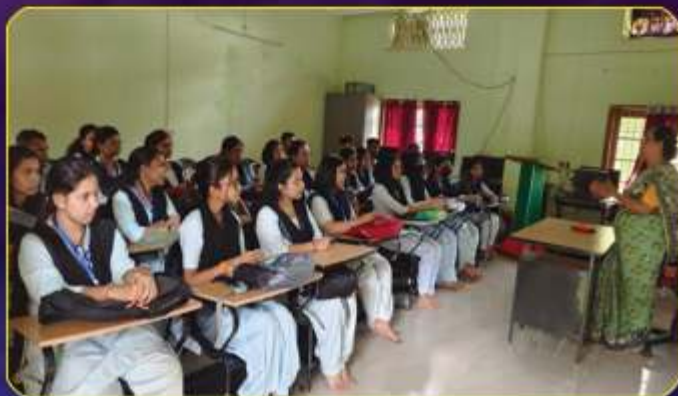
Class in Progress: Department of English