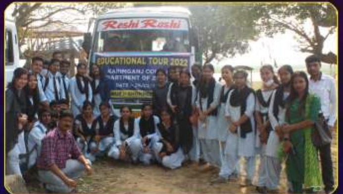
Educational Tour by Department of Zoology