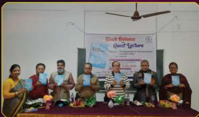
Book Release by Department of Political Science