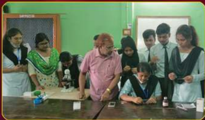
Students Performing Laboratory Experiment Department of Biotechnology