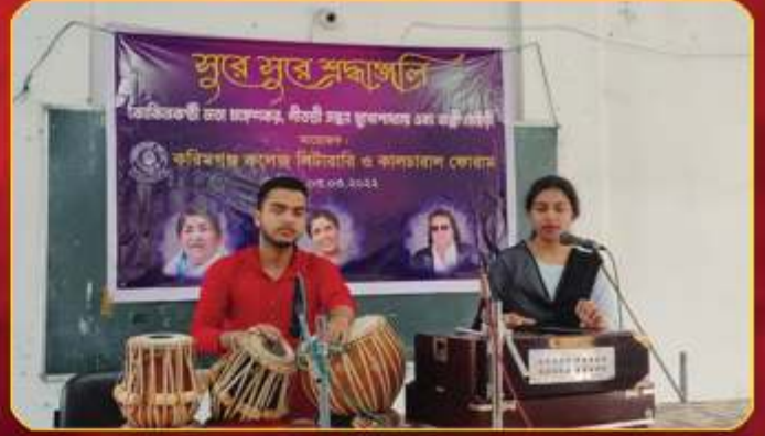
Students Performing in Shradhajali Programme