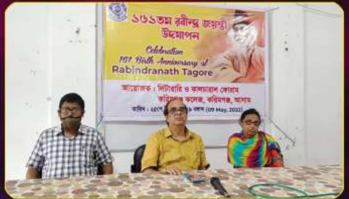
Observation of Rabindra Jayanti