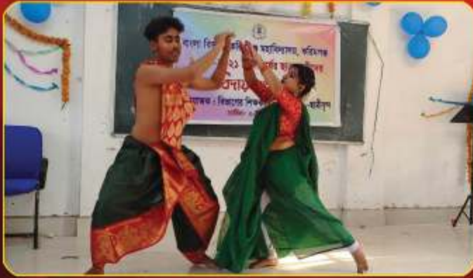
Students Performing Farewell Programme Organised by Department of Bengali