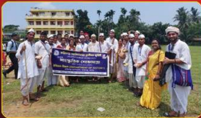
Group Picture by Department of History in Connection with Sanskritik Shovajatra of Platinum Jubilee Celebration