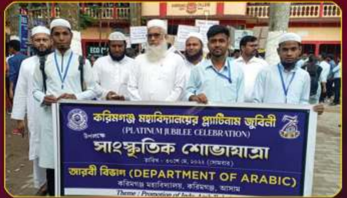
A Still of Sanskritik Shovajatra by Department of Arabic