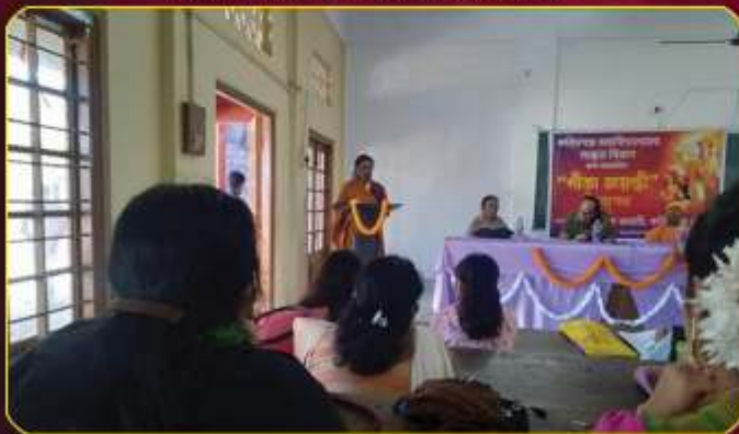
Gita Jayanti Celebration: Department of Sanskrit