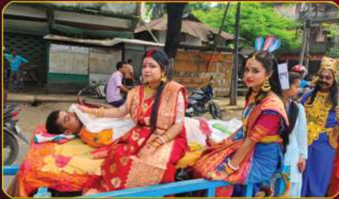
Display of Manasa Mangal Akhyan in Shovajatra Organized by Dept. of Bengali