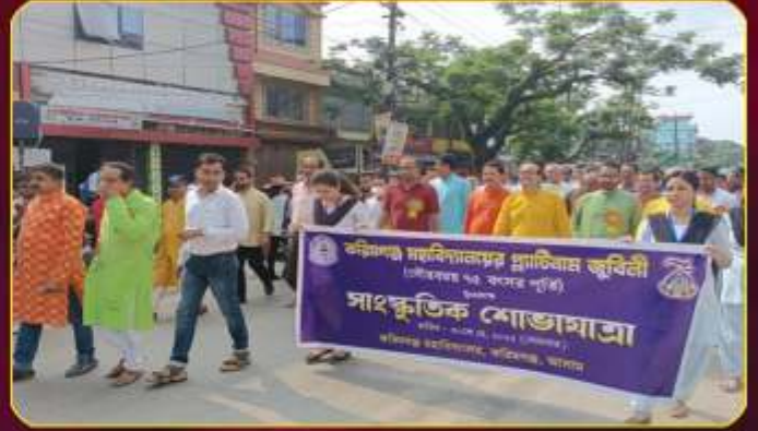
A Moment of Sanskritik Shovajatra in Connection with Platinum Jubilee Celebration