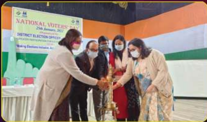
National Voters' Day Organized by District Authority at District Library, Karimganj