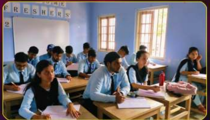
Class in Progress: Department of Statistics