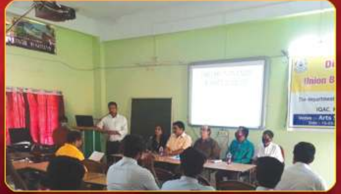
Discussion on Union Budget 2022-23 by Department of Economics and Commerce