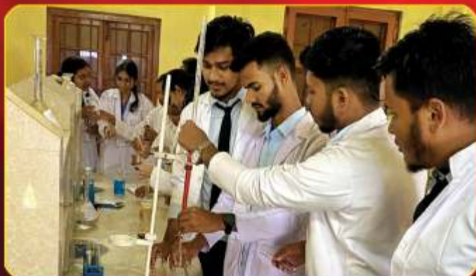
Laboratory Experiment: Department of Chemistry