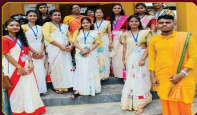
A Moment of Platinum Jubilee Celebration by Department of Philosophy