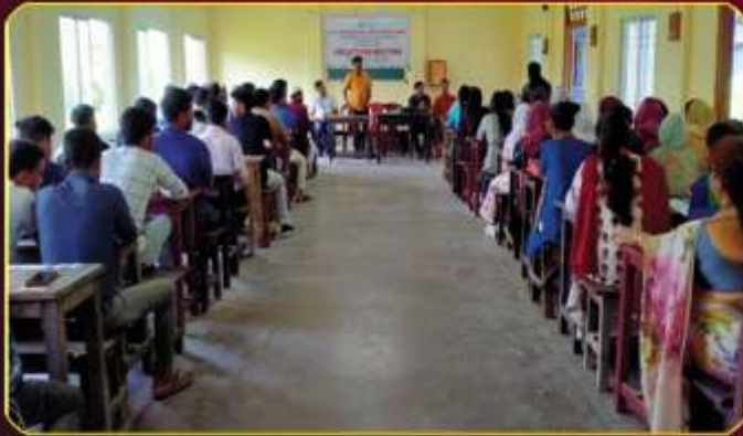
Induction Meeting, IGNOU Study Centre Karimganj College