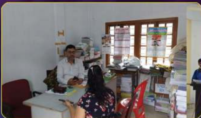
Office of the Coordinator, Krishna Kanta Handiqui State Open University Karimganj College Study Center