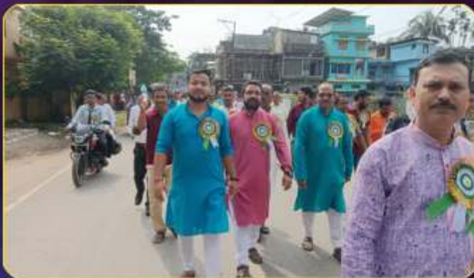
Non Teaching Staff of Karimganj College in Sanskritik Shovajatra