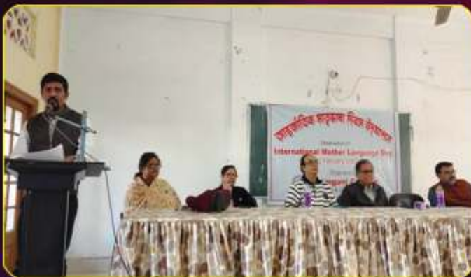
Observation of International Mother Language Day